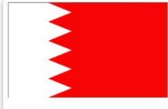
BH | BAHRAIN