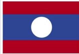
LA | LAOS