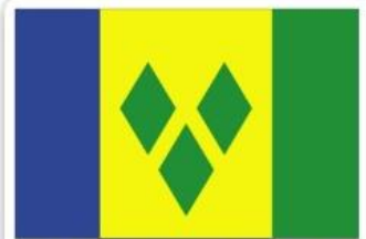
VC | SAINT VINCENT AND THE GRENADINES