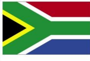
ZA | SOUTH AFRICA