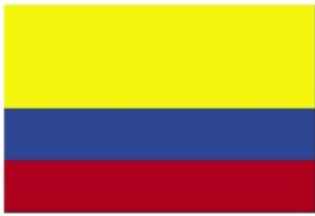
CO | COLOMBIA