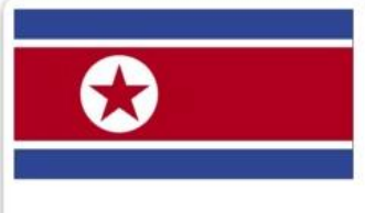
KP | NORTH KOREA