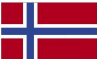
SJ | SVALBARD (SOMETIMES REFERRED TO AS SPITZBERGEN)