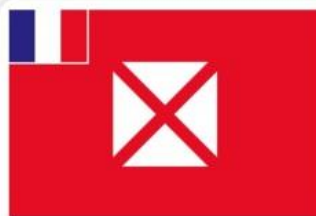
WF | WALLIS AND FUTUNA