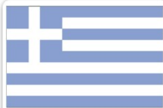
GR | GREECE