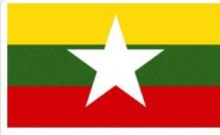
MM | BURMA