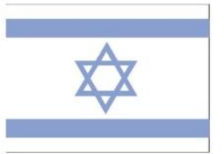
IL | ISRAEL