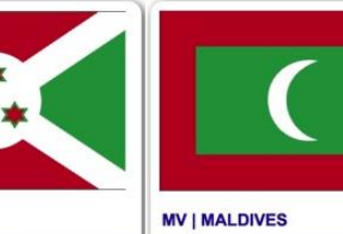
BI | BURUNDI