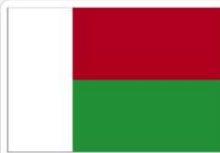
MG | MADAGASCAR