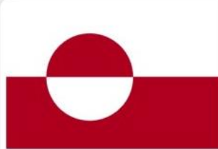
GL | GREENLAND