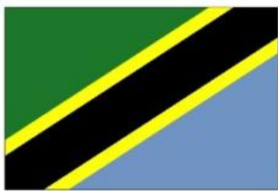
TZ | TANZANIA