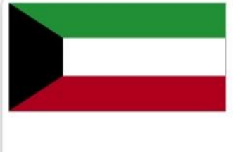
KW | KUWAIT