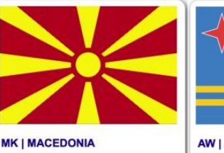
MK | MACEDONIA