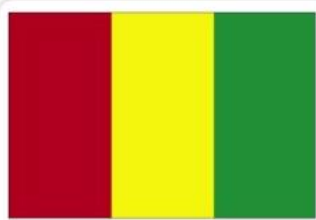
GN | GUINEA