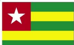
TG | TOGO