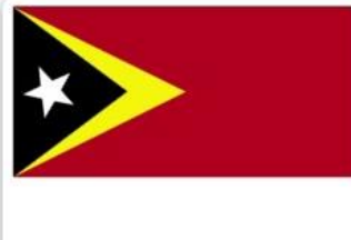
TL | TIMOR